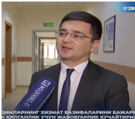
Liability for preventing pedagogical staff from carrying out their tasks