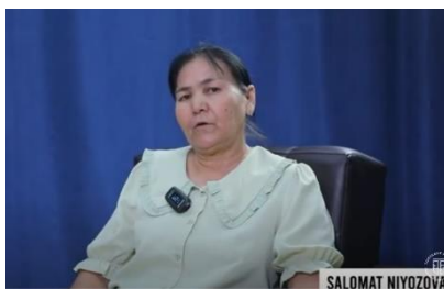
Definition on the Law of the Republic of Uzbekistan