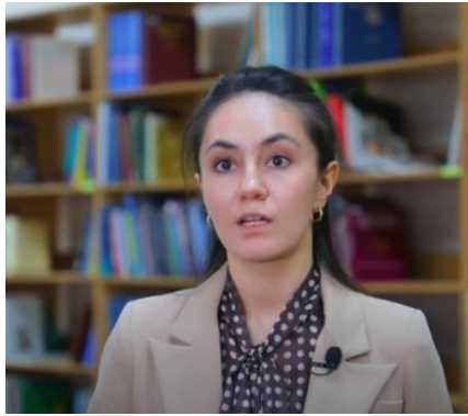
Education Reforms in the New Constitution by Layla Aslonova