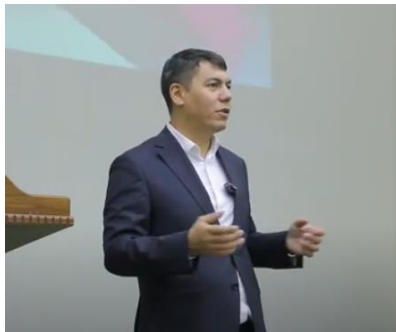
“Fraud, its types, prevention” by Razzak Altiyev