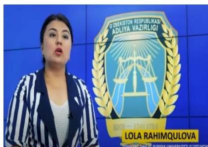
Is it possible to resolve labour issues through mediation?